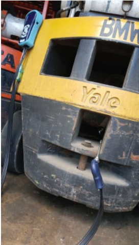
Hands Free Operation